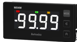
Timers, Counters, Panel Meters