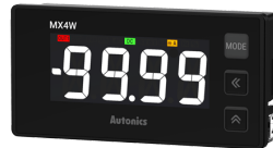
Timers, Counters, Panel Meters