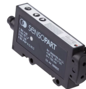
Fiber Optic Amplifiers