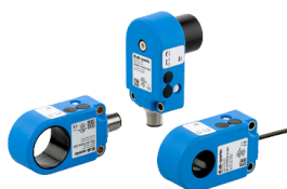
Inductive Ring Sensors