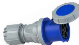
Pin & Sleeve Connectors

PROUDLY SERVING THE INDUSTRIAL MARKET FOR 35 YEARS!